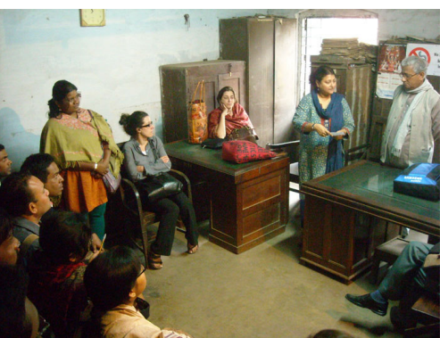
Participants at the camp office